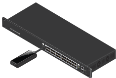
EdgeSwitch Power Connection Diagram

The CRM Point can be powered by an EdgeSwitch or other 802.3af-compliant switch.